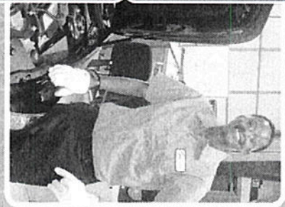
JOB CORPS CENTER